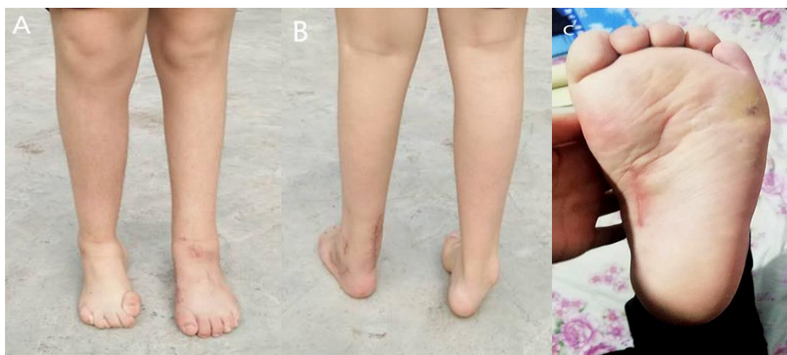
Figure 5: (A) Three months after operation, both feet orthotopic film; (B) the posterior position of both feet was taken, and left foot deformity was corrected; (C) Plantar ulcer healing 3 months after surgery.