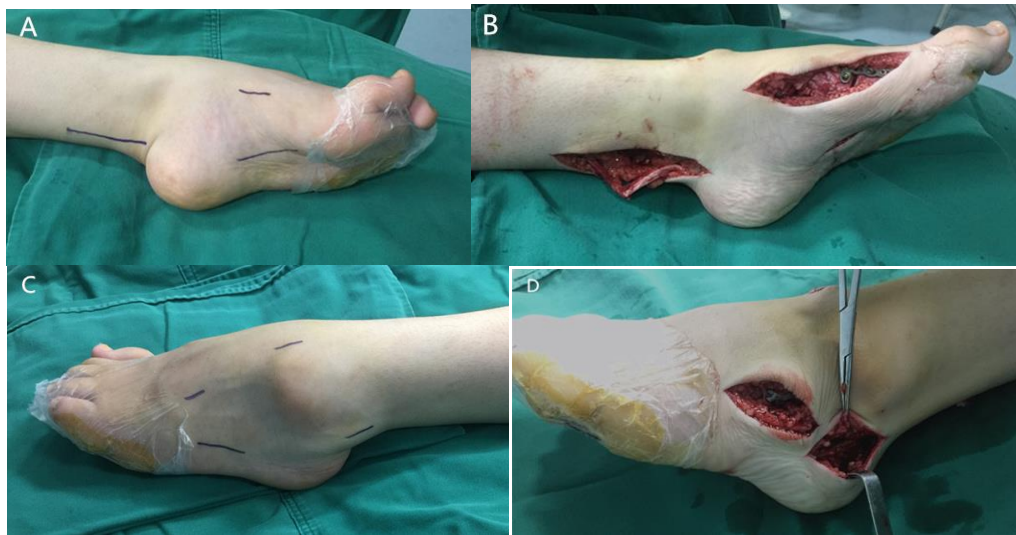
Figure 3: Intraoperative findings : (A) Achilles tendon, posterior tibial tendon insertion, plantar aponeurosis incision; (B) Release of the Achilles tendon "Z", release of the plantar aponeurosis, wedge osteotomy of the base of the first metatarsal, and reduction of the medial longitudinal arch; (C) calcaneocuboid joint, peroneal tendons and anterior ankle incisions; (D) Fusion of calcaneocuboid joint and calcaneal valgus osteotomy

On the 7th day after the surgery, after the inflammatory swelling subsided, patient is pian to perform active and passive activity. After the suture removal through the incision on the 14th day after the surgery, the knee joint flexion and extension on the bedside were performed to