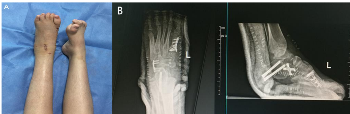
Figure 4: Postoperative results showed that: (A) the left foot Equinovarus deformity was corrected with A beautiful appearance, and the right foot deformity was not operated on; (B) Postoperative X-ray examination

train muscle strength. On the 35th day after the operation, patient is required to walk with two crutches or Help line device without weight. 60 days after surgery, partial weight-bearing walking exercise was started. After 90 days of surgery, walk with full weight and resume daily life.